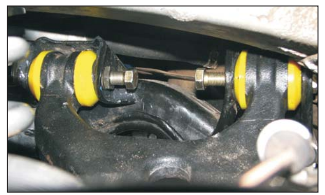
Fig 4 - right control arm, side view.

Warning: Please drive carefully while you accustom yourself to the changed vehicle behaviour.