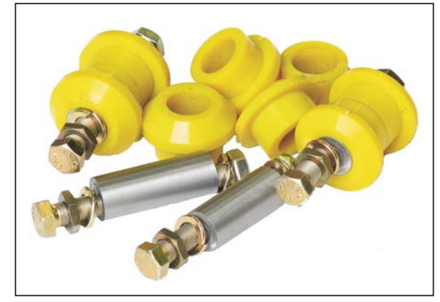
Fig 1 - KTA326 kit.