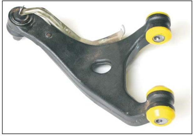
Fig 2 - left control arm with new bushes.