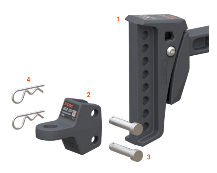
*Trailer ball platform (#45940-85 or #45970-85) not included