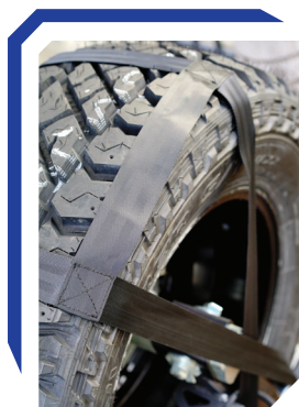
Fully Adjustable Harness System