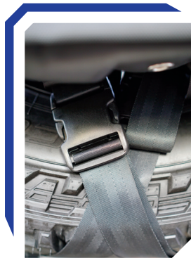
'Quick Fit' Harness