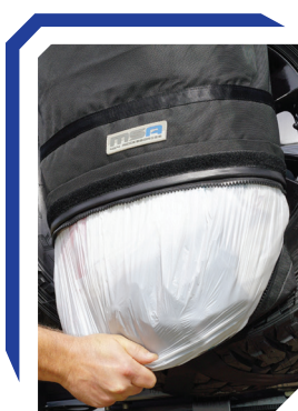
Easy empty base

Your rubbish is secure with a YKK Chunky zip and double, reinforced sides. The Rear Wheel Bin comes with a stainless steel drainage eyelet to release any fluids, a quick-fit, 50mm harness system that can be installed and removed in 30 seconds and will fit any tyre size including caravan and camper spares.